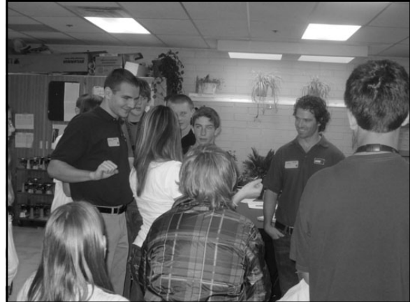
WL Gore is one of the many businesses involved with Skills for Success.

owners tell your students what they find valuable in employees.