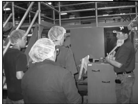
Students visited Aveda Salons, Northern Arizona Signs and SCA Tissue as part of the Skills for Success program.

Arizona Signs & Graphics , where they learned how to transfer lettering cut from rolls of colored material onto signs.